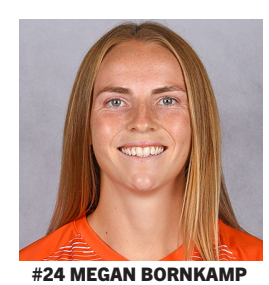
D • 5-9 • Sr.