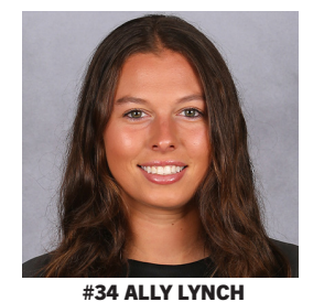
GK • 5-8 • Jr.